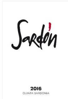
CASTILLA Y LEÓN RED BLEND, SARDÓN